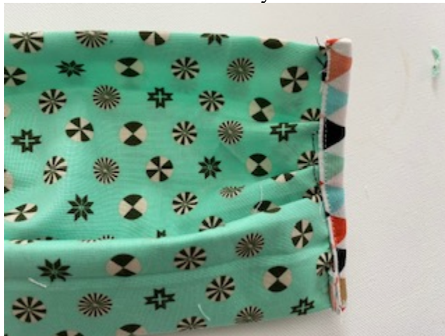
Finished back view