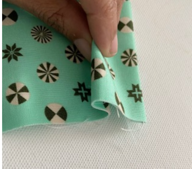
Step 2b-Form 3 pleats on each side. Pin down