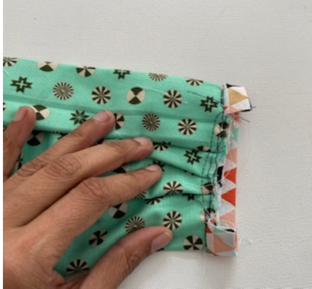
View of the back after you turn it over